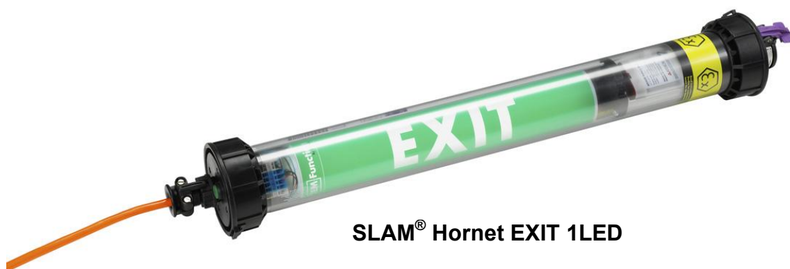
SLAM ® Hornet EXIT 1LED